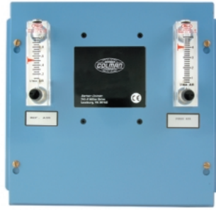
Dual output supply shown

The reference air enclosure is a self-contained CE compatible unit that provides reference air to the AP3 oxygen probe. Reference air of approximately 20% oxygen must be supplied for the probe to perform properly. The reference air enclosure may be supplied with a single flowmeter and output for one probe operation or a dual flowmeter and output for dual probe operation.